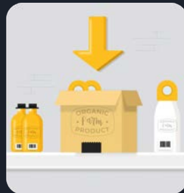
Picking, Packing, Receiving