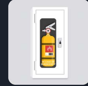
Track Security Patrols